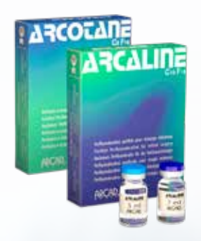
ARCALINE - ARCOTANE Heavy Liquids for Ophthalmic Surgery