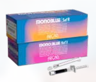
MONOBLUE Ultra-Purified Trypan blue solution