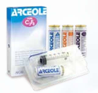
ARCEOLE Ready-to-Use Set of Ophthalmic Gas