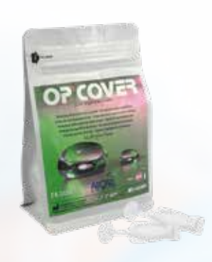
OP'COVER Corneal Protection

FOR COMPLETE PRODUCT INSTRUCTIONS, PLEASE REFER TO THE IFU SUPPLIED WITH THE PRODUCT