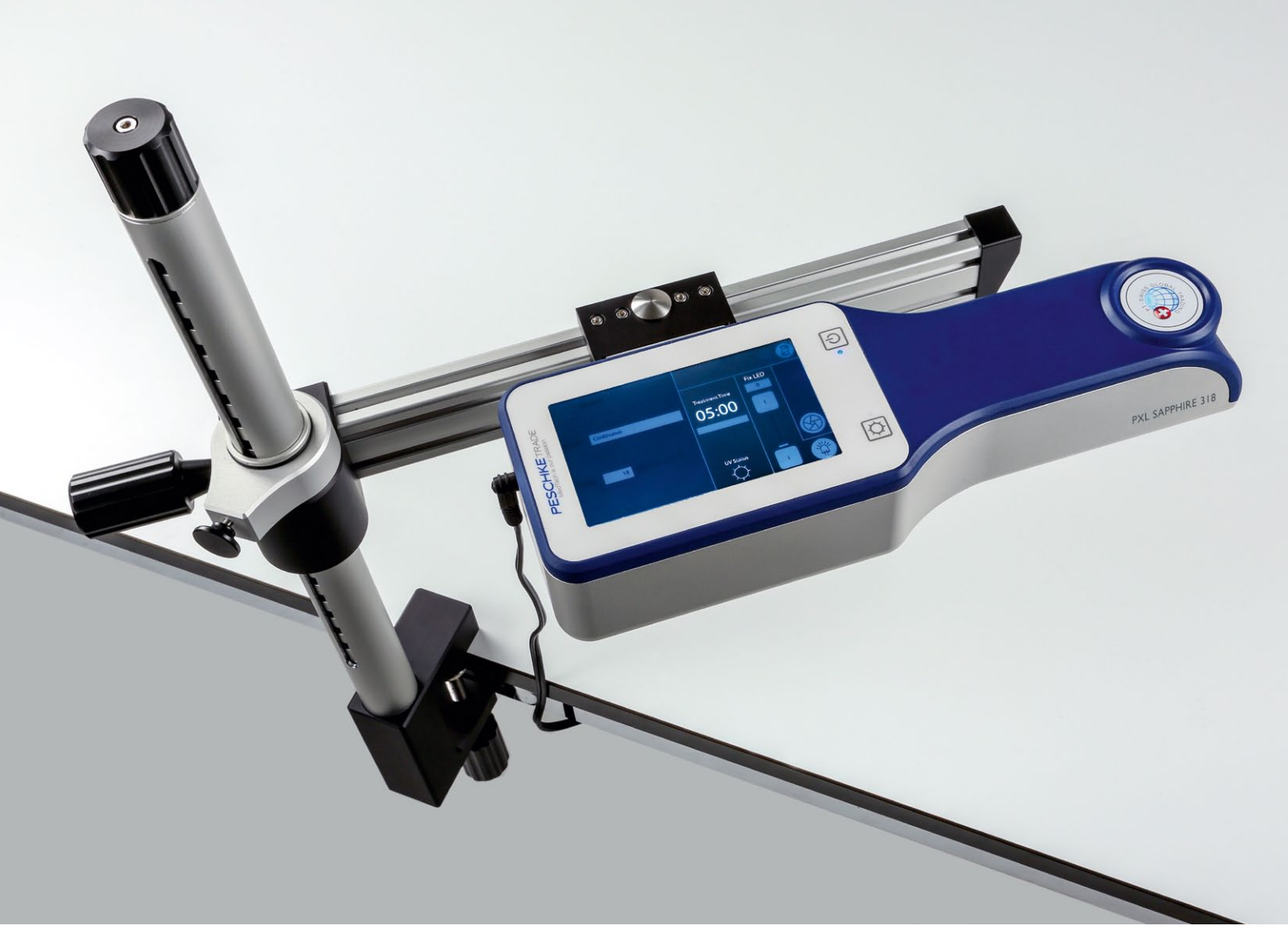
The PXL SAPPHIRE 318 is portable with a high quality table mount.